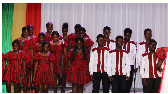
The Vikings singing