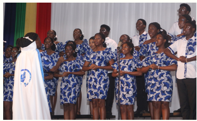
The Spartans singing