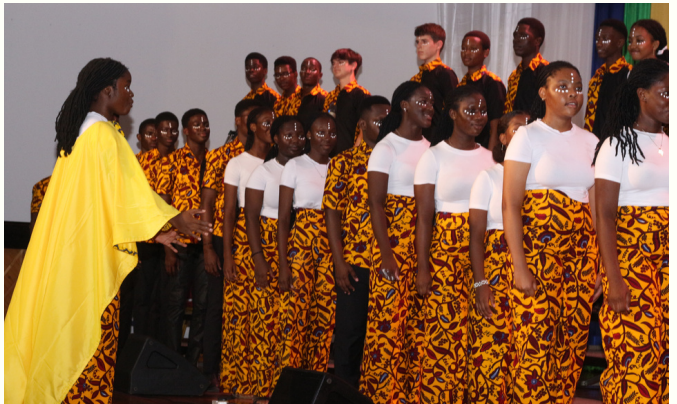
The Trojans singing

When all was said and done, and parades around the school were over, the Trojans continued to silently pulsate the electrifying energy peculiar to new victors. That was one of the most intense yet rewarding competitions.