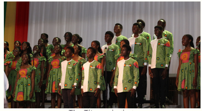
The Titans singing