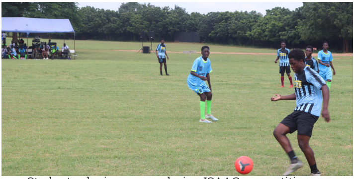
Students playing soccer during ISAAG competitions

The ISSAG football tournament took place on the 21st and 22nd of October, 2022 at the Achimota school in Accra. We witnessed teenagers represent their schools for the ultimate title; 2022 Champions of ISSAG football tournament. Schools represented were Faith Montessori, Ghana International School (GIS), International Community School, East Airport International School, Ghana International School, Christian High, Morgan International Community school, Galaxy International School, SOS-HGIC, Akosombo International School, The Roman Ridge School and DPSI International. SOS-HGIC presented 40 players for both the boys and girls football teams. Both teams managed to qualify for the knockout stages with the boys' team beating East Airport by 4-0 and the girls' beating Akosombo 2-1. The girls were able to make it to the semi finals but lost 1-0 to GIS and the boys also lost 2-0 to Akosombo.