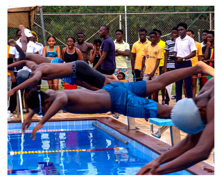
Students during swimming competition