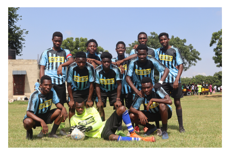
SOS HGIC football team