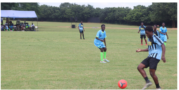
Students playing soccer during ISAAG competitions

The ISSAG football tournament took place on the 21st and 22nd of October, 2022 at the Achimota school in Accra. We witnessed teenagers represent their schools for the ultimate title; 2022 Champions of ISSAG football tournament. Schools represented were Faith Montessori, Ghana International School (GIS), International Community School, East Airport International School, Christian High, Morgan International School, Christian High, Morgan International School, SOS-HGIC, Akosombo International School, The Roman Ridge School and DPS International. SOS-HGIC presented 40 players for both the boys and girls football teams. Both teams managed to qualify for the knockout stages with the boys' team beating East Airport by 4-0 and the girls' beating Akosombo 2-1. The girls were able to make it to the semi finals but lost 1-0 to GIS and the boys also lost 2-0 to Akosombo.